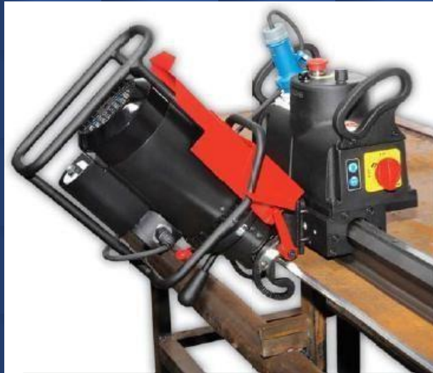
PLATE BEVELING MACHINE